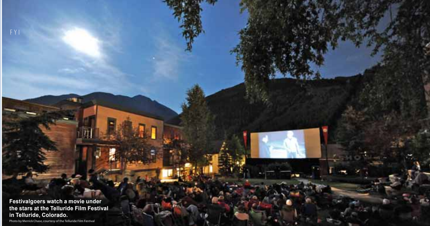
Festivalgoers watch a movie under the stars at the Telluride Film Festival in Telluride, Colorado.