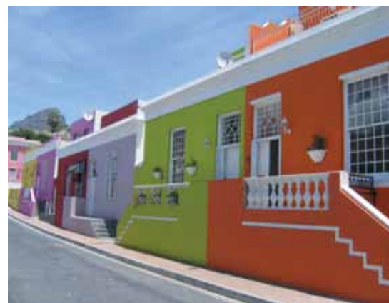
Preceding page, an aerial view of Cape Town, perched on the coast of South Africa. Above, an African penguin on nearby Boulders Beach and the brightly painted houses of Cape Town's Malay Quarter.